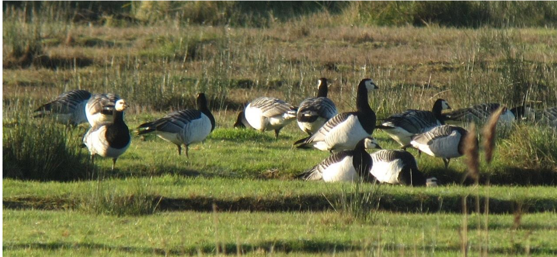
Barnacle Geese, 12 of the flock of 42 that lingered into 2011 (S. Robson)