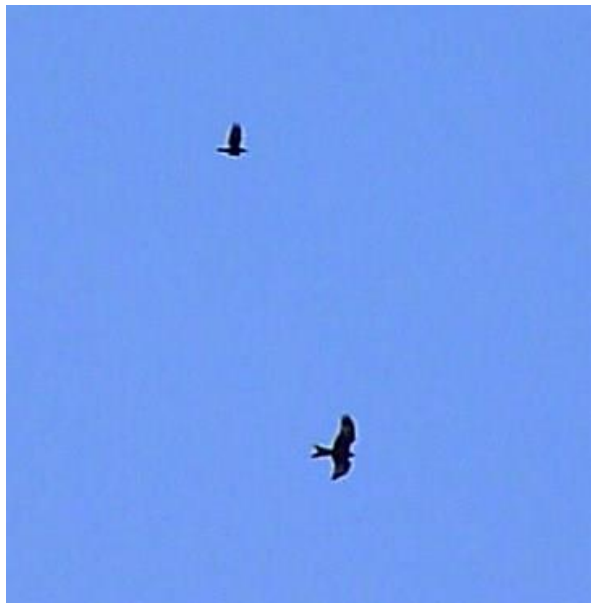
Red Kite, 10 th Nov (S Robson)