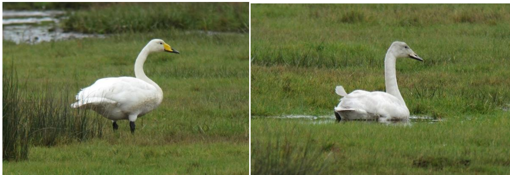
Ad and Juv Whooper Swans