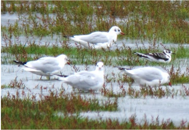
Juv Little Gull, 3 rd Oct (S Robson)

The first record since 2004. A juv visited the Pool during stormy weather on 3 rd Oct