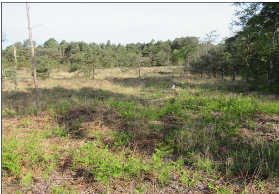
Fig.1 Habitat at Goathorn

A total of 249 species, including aggregates, have been recorded. 78 of these are classified as micro-moths and 171 macro moths. In a number of instances, micro-moth species identification has been verified by Dr Phil Sterling at Butterfly Conservation.