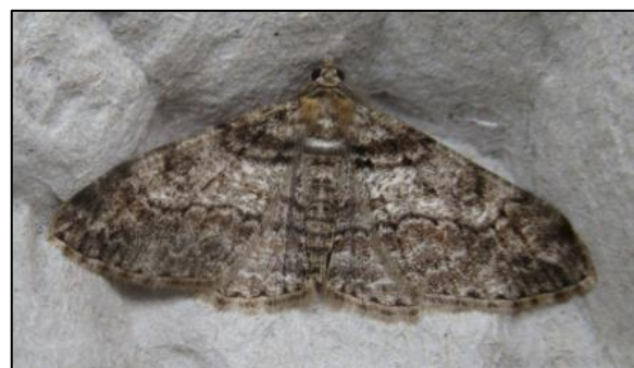
Fig.9 Ringed Carpet

1939 Ringed Carpet Cleora cinctaria cincture Nationally Scarce A – A scarce and restricted resident in Dorset. One on 1 st May 2019. This is an early season species. Also recorded by MoPH at Arne Moors, Creech Heath and Grange Heath. Larval foodplants are Birches, Bilberry, Bog Myrtle, Bell Heather and Cross-leaved Heath. Seems to be particularly associated with Bog Myrtle on Dorset Heaths. Recorded in 5 x 1km squares in Living Record 2000-2019. (1,1)