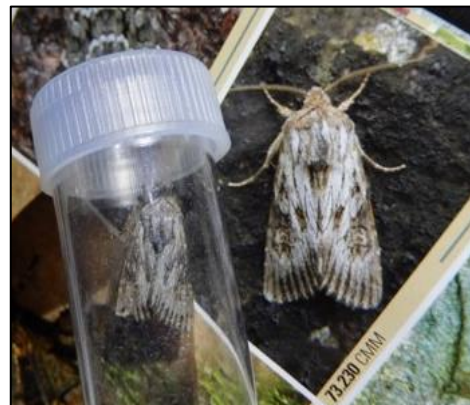
Fig.5 Feathered Brindle (in tube)

2230 Feathered Brindle Aporophyla australis pascua Nationally Scarce B – A single record on 28 th September 2017. This is an uncommon and mainly coastal resident in Dorset. Foodplants include Sea Campion and coastal grasses. Recorded in 1 other 1km square on Living Record 2000-2019. (1,1)