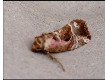
Fig.7 Rosy Marbled

2396 Rosy Marbled Elaphria venustula Nationally Scarce B – Recorded twice with 6 individuals on 7 th June 2018 and 2 on 28 th June 2018. A rare and very local resident / wanderer in Dorset. Foodplant is thought to be Tormentil. Also recorded by MoPH at Corfe Castle and Hartland Moor. This species appears to be breeding here and has a preference for warm gullies where Bracken grows. It may be that retention of Bracken, at least in part, on the site will be very beneficial. Recorded in 5 x 1km squares in Living Record 2000-2019. (2,8)