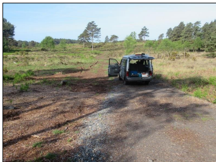
Fig.11 Moth trapping at Goathorn