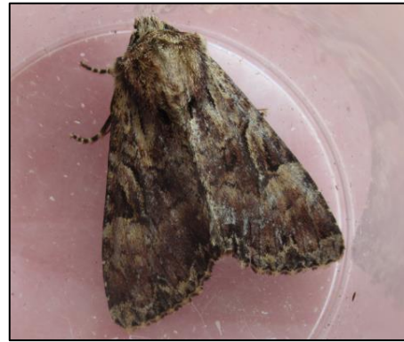
Fig.3 Clouded Brindle

2327 Clouded Brindle Apamea epomidion – One on 5 th July 2018. A scarce and thinly distributed or restricted resident in Dorset. Feed on Grasses in woodland. Also recorded by MoPH at Ballard Down and Holton Lee. Recorded in 6 x 1km squares in Living Record 2000-2019. (1,1)