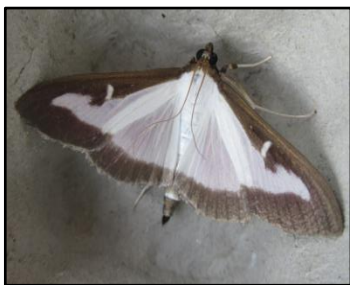
Fig. 1 White morph

In addition, a PhD student from Royal Holloway, University of London, was studying the 3 colour morph variations and sex ratio of the species. To this end details on morphs and sex was recorded and the results are summarised here.