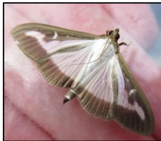
Fig. 2 Intermediate morph