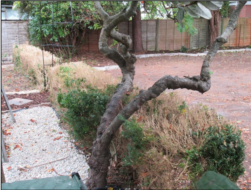
Fig. 4 The Box hedge in the property adjacent to the Hamworthy recording garden

Box-tree moths accounted for 50% of the catch (124 individuals) from 2 MV traps on 20 th September 2020.