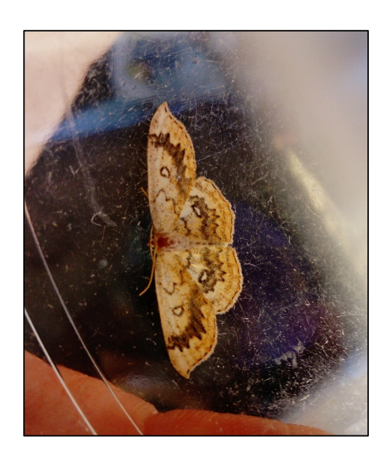
Mocha – A stunning Notable B moth that feeds on Field Maple. It is an uncommon and restricted resident in Dorset.