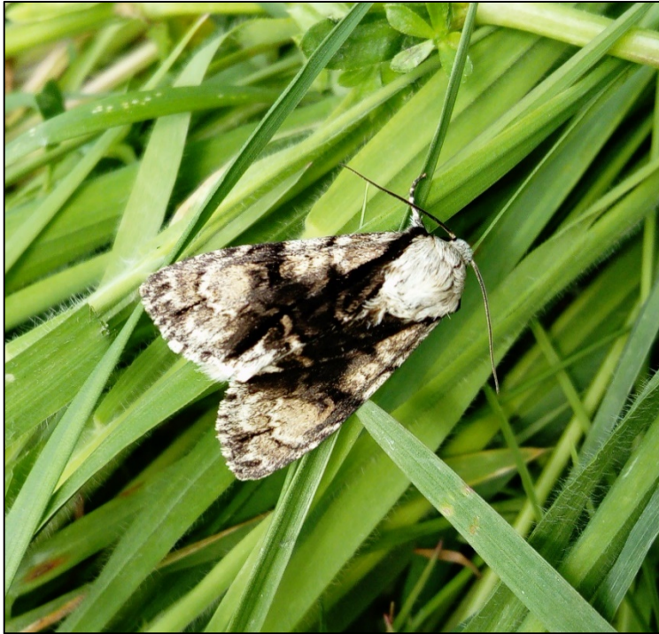
Alder Moth – Local and thinly distributed, this distinctive species feeds on a variety of broadleaved trees. It has only been found by the project on Ballard Down.

Blackneck – Feeding on Tufted Vetch as a larva, this local species seems to be expanding its range. Found by the project in both 2018 and 2019, the Blackneck appears to be quite locally common with 21 individuals found on four occasions.