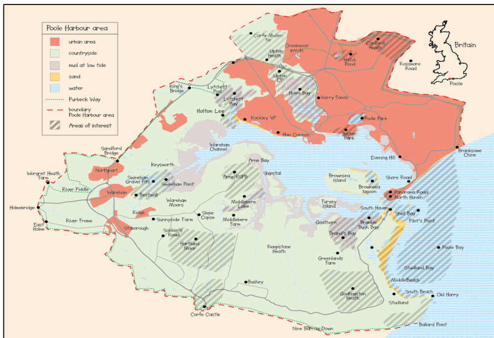
Birds of Poole harbour recording area

The 'Moths of Poole Harbour' project was set up in 2017 to gain knowledge of moth species occurring in Poole Harbour, Dorset, their distribution, abundance and to some extent, their habitat requirements. The study area uses the same boundaries as the Birds of Poole Harbour project.