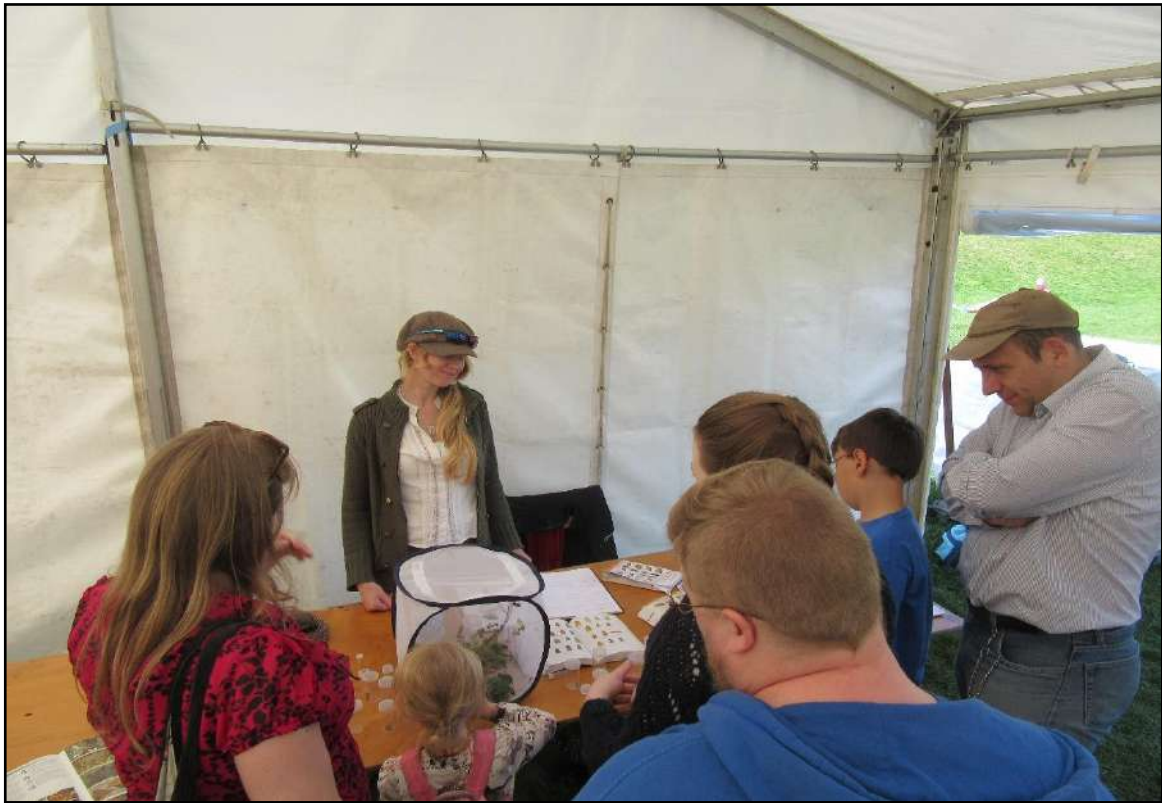
Visitors admire the catch of the day