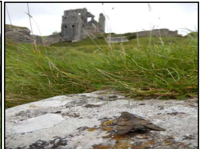
Moth trapping at Corfe