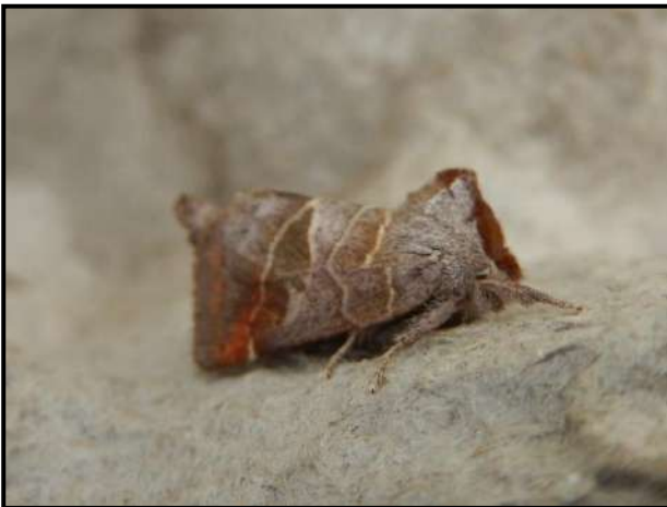
Small Chocolate Tip