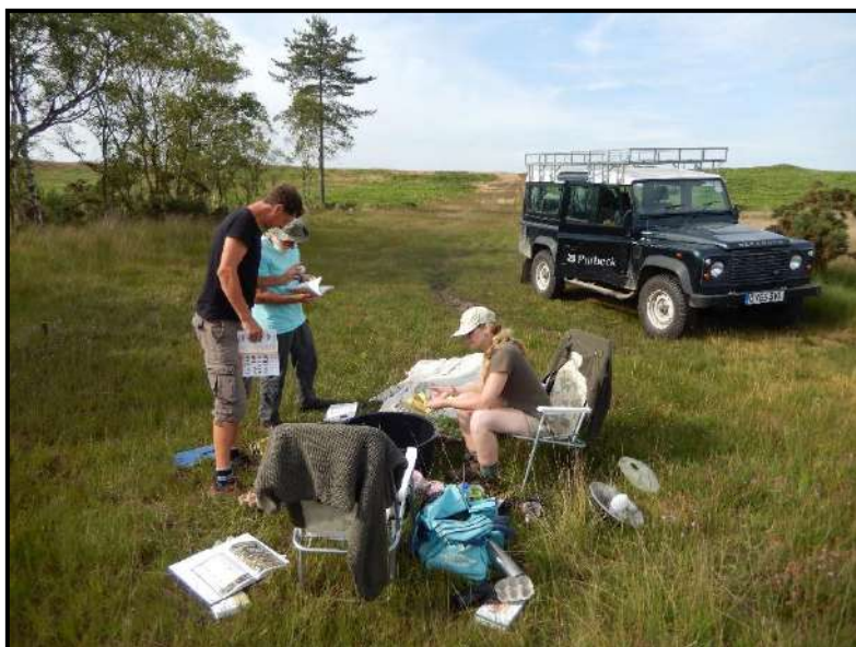
Checking the traps at Slepe Heath