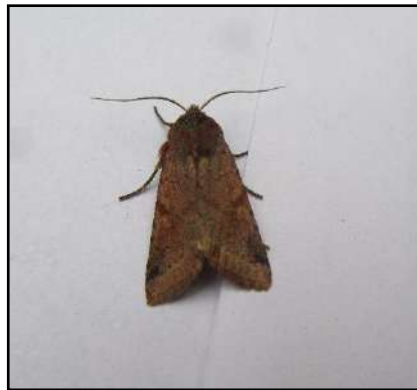
Southern Chestnut Goathorn 3 rd October

The species is classified as RDB 2, following discovery in the UK in Sussex in 1990. It has become well-known on heaths on the north side of the harbour and is known to be spreading. Following the first record it was found quite easily on Holton Lee on 2 occasions (1 and 3 specimens), again on Goathorn on (3 on 12 th October), and on Slepe Heath (3 on 14 th October). Unfortunately, the 2 attempts to trap for it on Canford Heath had to be abandoned through inclement weather. It would be interesting to confirm its likely presence on other heathland sites such as Studland, Arne, Upton and Canford next year. It would now seem highly possible that it has indeed spread to all suitable habitat around the harbour. It has a very convenient habit of appearing on the wing, and coming to light, for only about 45 minutes after dusk.