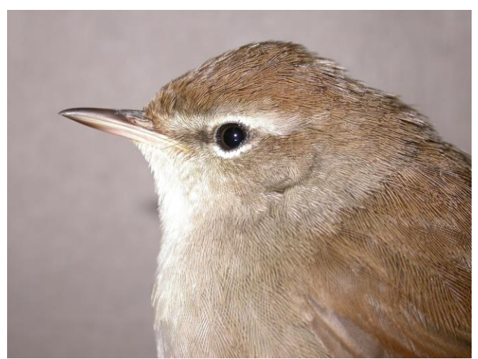
Cetti's Warbler, Sandy Close Pond, Dec

Breeding resident. 8 territories again this year. Better than expected given the cold winter preceding the breeding season. A young male remained at Sandy Close Pond from 28<sup>th</sup> July until the year end. 7 ringed.