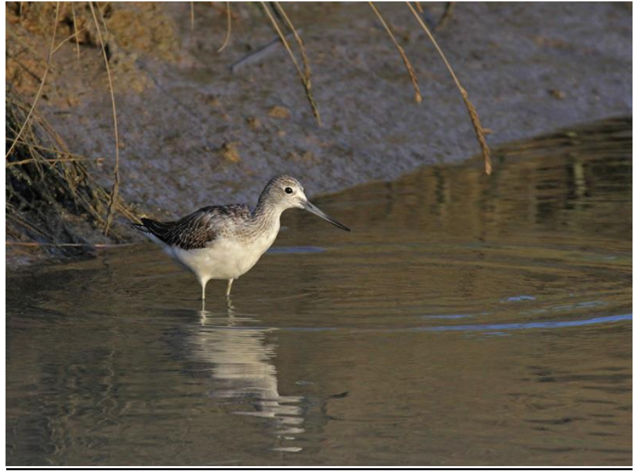
Greenshank near the sluice