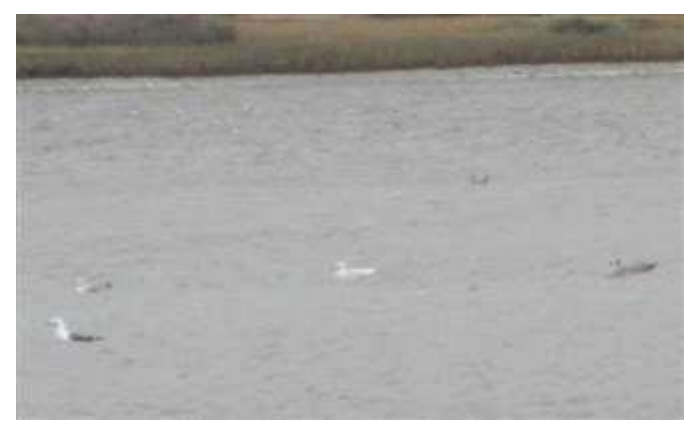
Iceland Gull, record shot, Mar 2008