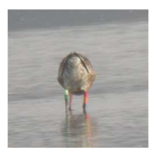
RR+WL – 6<sup>th</sup> – 25<sup>th</sup> Apr. Ringed at Álftafjörður, E Iceland as a female on 3<sup>rd</sup> Apr 2000. It has been recorded at The Bay in both 2006 & 2007. It has spent the winters in Western France.

LG+RO – 6<sup>th</sup> & 8<sup>th</sup> Apr. Ringed at Langhús, Fljót, N Iceland as an adult female on 26<sup>th</sup> June 2002. This bird also visited the Bay in Apr 2006 & 2007 (It was mistakenly described as LG+OR in the 2007 report). It has also been seen on Humberside, the Avon Valley, and Western France and wintered in Tejo Estuary, Setúbal, W Portugal in Jan 2008.