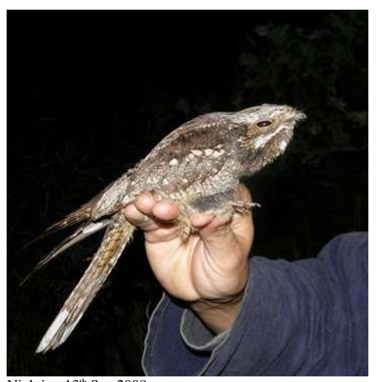
Nightjar, 13th Sep 2008

Irregular breeder. A good year with 3 males holding territory in early June. Singles were recorded on the Far Fields on 4 dates in autumn between 22<sup>nd</sup> Aug and 13<sup>th</sup> Sep. 2 migrants ringed in Sep.