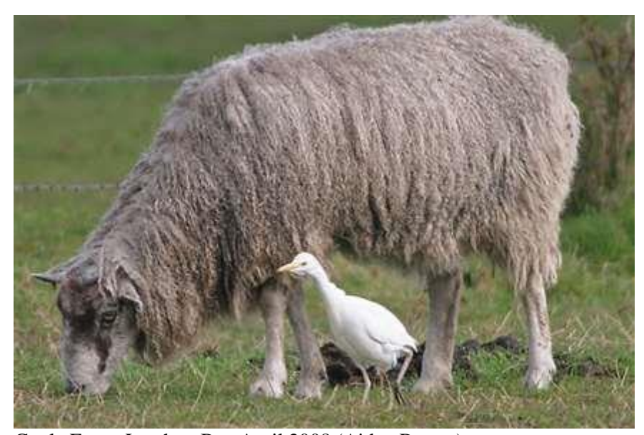
Cattle Egret, Lytchett Bay April 2008