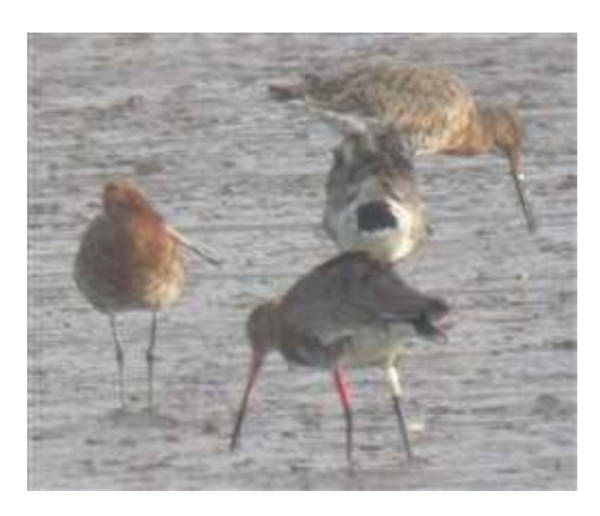
G//R+GN – 9<sup>th</sup> Apr. Ringed at Farlington, Hampshire as a juvenile male on 17<sup>th</sup> Sept, 2005. Also recorded in 2007. All subsequent sightings until this one were around south east Hampshire.

YG+WR(flag) – 18<sup>th</sup> Apr. Ringed at Midjanes, Reykholar, NW Iceland as a chick on 9<sup>th</sup> July 2007. It spent Sep of that year at Radipole and Lodmoor.