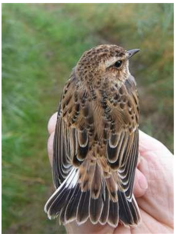
1<sup>st</sup> yr Whinchat, 22<sup>nd</sup> Aug