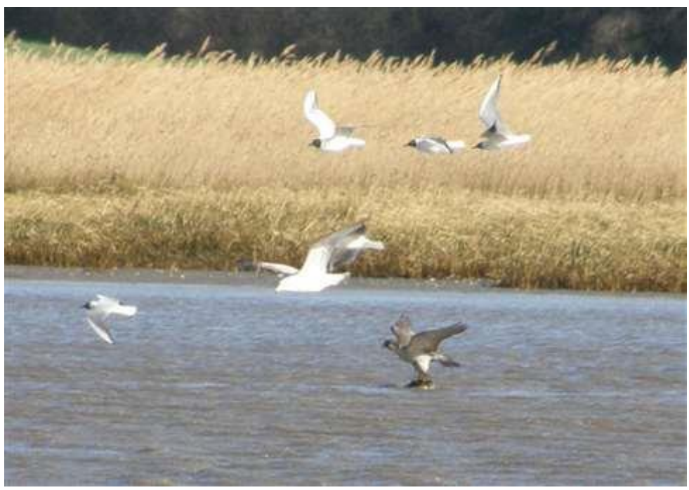
Peregrine drowning male Teal, Mar 2008