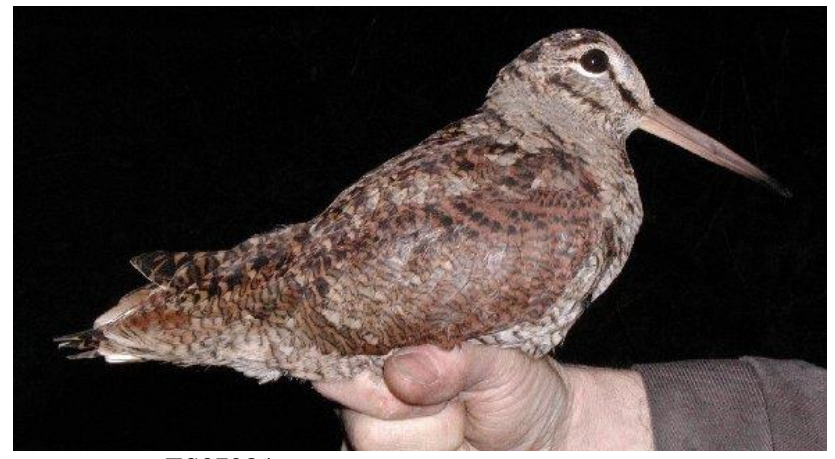
Healthier days, ES07284 before its incredible journey!