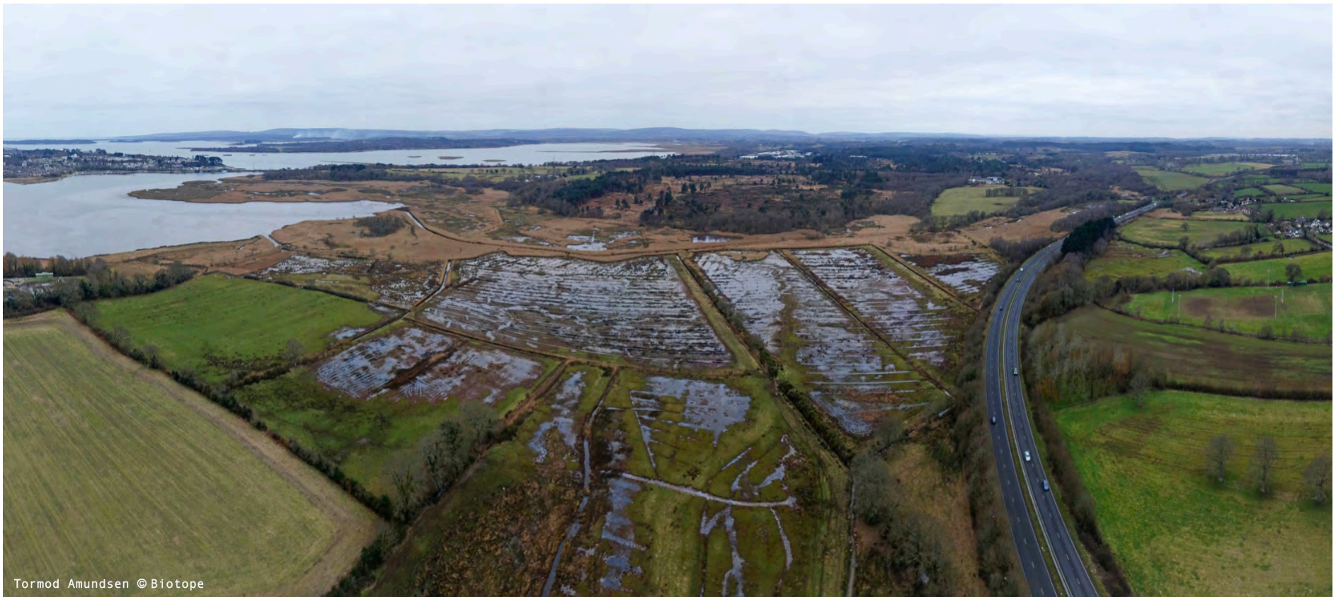
Birds eye view of Sherford Pools and French's Pools aka – Lytchett Fields